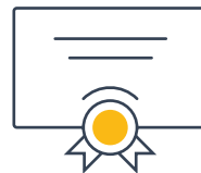
Increased role readiness