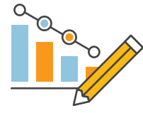
Lower administrative burden