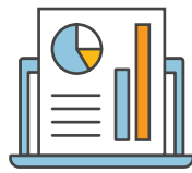
Complete view of training status