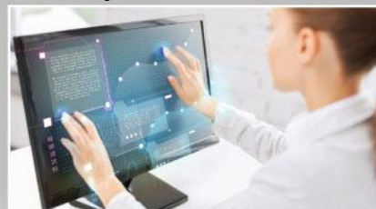
analytics & visualization