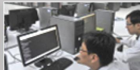
architect / engineer