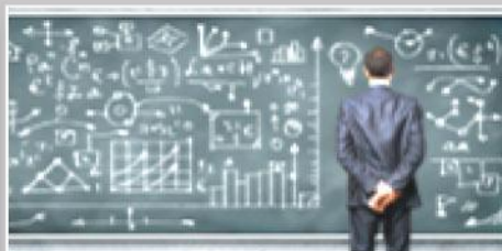
data analyst / scientist